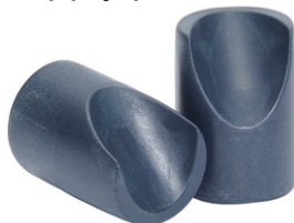
Chair V-Tip Caps