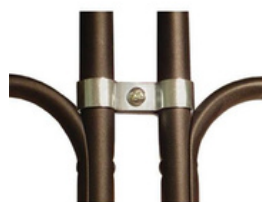
Plastic Ganging Clamps